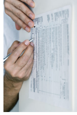
At intake, You Will Complete an Application for Services

Also, bring your charging documents (if you have these), all documents you have received from the Court, and any witness contact information.